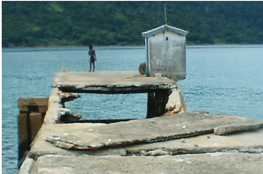
Figure 1 : Pier of CNRO (damaged by GAFILO storm) with the tide gauge hut

The pier was seriously damaged by the storm GAFILO in 2004. It must be rebuilt before any tide gauge installation. (See figure 1 below)