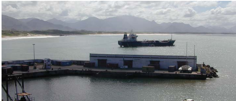
Figure 12 : View of the new pier of the port of Moroni (at left behind, the old first pier of the port) There is not enough water depth to install the tide gauge here and the concrete blocks are collapsing into water