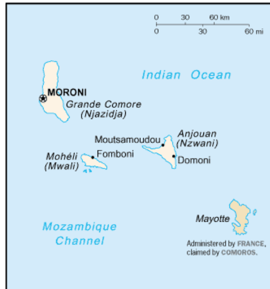
Figure 6 : Archipelago of COMORES

Coastal town of Moroni is located in the west part of the island ( 43^{\circ}14,5' E - 11^{\circ}42'S ).