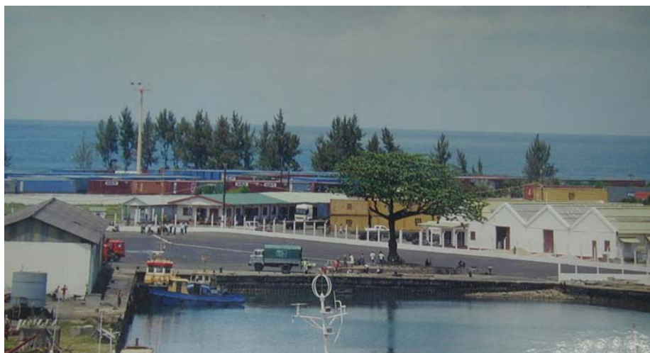
Figure 3 : The location of the old tide gauge is (approximately) just behind the van.

The old tide gauge installations (tide house, tide well and associated BM) have been destroyed and replaced by a fresh new car park in 2005 (see figure 3 below).