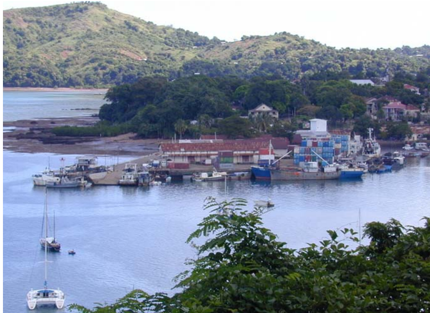
Figure 10 : View of the harbour office of Tamatave (Could be a location for the new tide gauge ; easy power supply, in front of the pilot office, ... but no protection again waves (or swell) from wind and tide house to build).