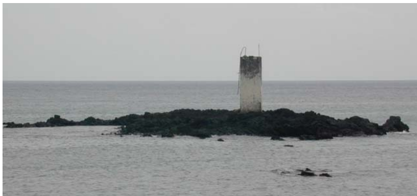
Figure 8 : Souadzou islet with ruins of the lighthouse.

Only an old bench mark (1953) could still be present, embedded in the lighthouse building of the islet “Souadzou” (or “Souazou”) (see figure 8).