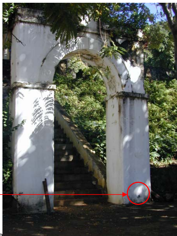
Figure 2 : French Hydrographic Office BM

The distance between the BM and the tide house is about 80 metres, and not too long for classic levelling.