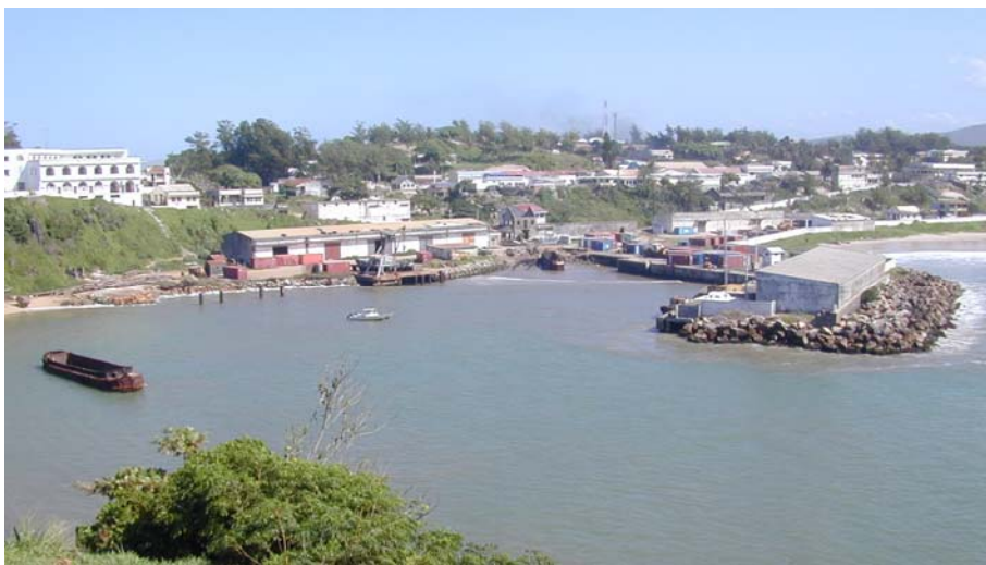
Figure 4 : View of the Fort-Dauphin port.

A visit of the port installations was organized with the port master. There isn't any guard to ensure the security of the port. Any gate also. Many damaged containers, neglected within harbour, are used by poor people as habitation.