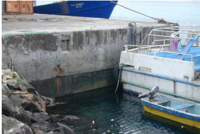
Figure 7 : South part of the “grand quai”

Security of the harbour is ensured by the presence of a police station located within the harbour. Moreover, guards of a private security company are present during the night.